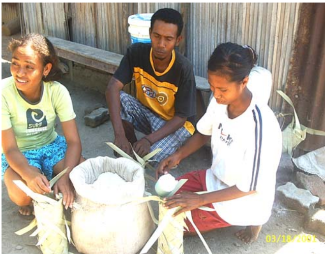
Kay Rala students prepare salt for their family business in Manatuto. Salt is sold in liter-sized woven palm baskets, seen in front.

Students at Nova and SETRA members are investigating the possibility of importing sea salt from Manatuto to distribute in Seattle. The local salt we brought home is excellent in flavor and texture, and salt is becoming an essential gourmet item for discriminating cooks in the Northwest as well as the rest of the USA. Like other SETRA projects, we aim to "give to the community twice". Exporting the salt will increase the economic opportunities for the family producers in Manatuto, and the profit from the sales here will continue to support our current projects, HIAM Health, and Kay Rala Secundaria. We hope to arrange for a small shipment soon so we can have samples for potential buyers to taste. . If you would be interested in purchasing this excellent sea salt, in any quantity, please call us at 206-523-3656 or 206-523-3278.